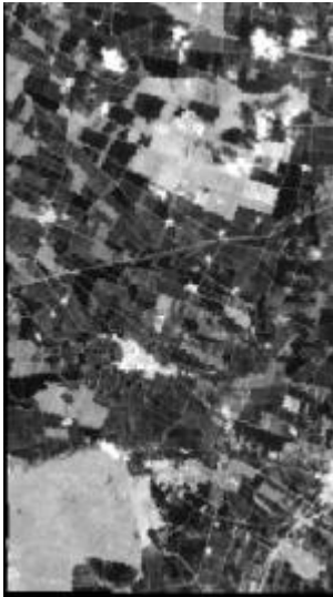
TM band 5