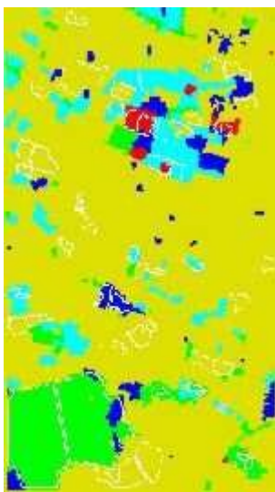
Joint TM and ERS

The comparison of the joint classification result with the ground truth region boundaries shows less ambiguity than the individual classification results. Indeed, the average probability of correct classification is now 0.883, a significant improvement compared with 0.792.